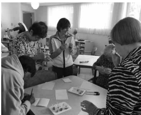
Sister Shower - "spice contest"