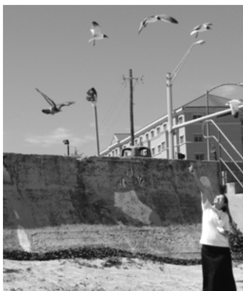
Below: Spent the day in Galveston - Lizette couldn’t resist but to feed the Galveston dove (seagulls) |Our final goodbye to the Trevino family - until next time!