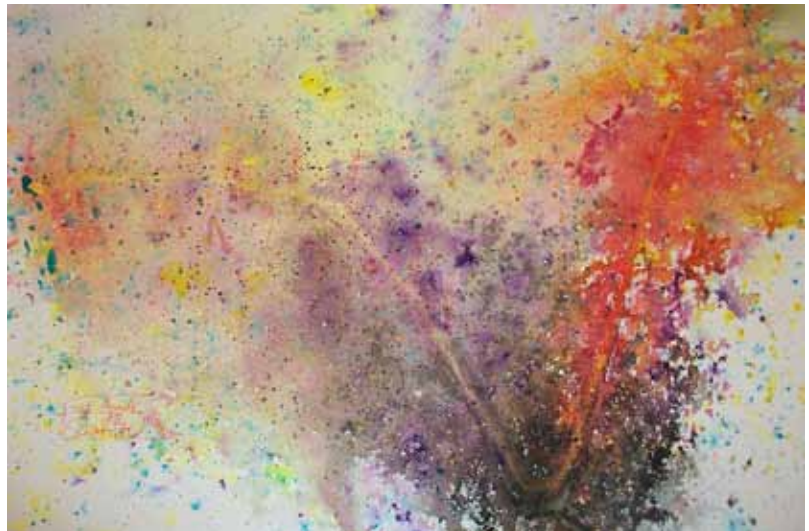
...My God, My Saviour!

God drew me back up through the Church and led me to the Charismatic Renewal movement. There, I experienced healing in many ways. I trustfully cooperated with God's grace and found myself transformed. In the painting, the steep line surrounded by yellow, orange, and red colours indicate that I have been lifted high and that I am totally in God's infinite mercy and love.