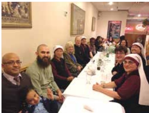
Took out CCY staff in gratitude for all they do!

In the 4 years we've been leading the women's sessions at Catholic Chaplaincy at York University (CCY), this year's sessions have been our biggest turnouts. The topics may have something to do with the draw: modesty, chastity, dating, sex, living together before marriage, same-sex attractions. We are still working our way through these topics but we want to share with you a little bit of our experience.