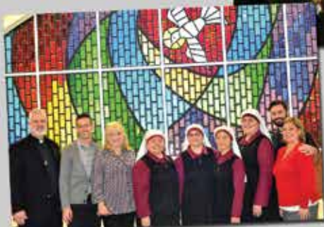
The Houston Team!