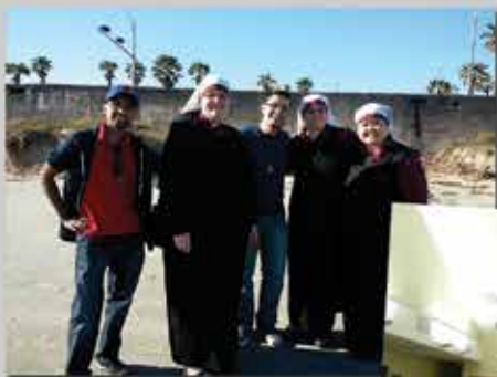
Hanging out with brothers in Galveston